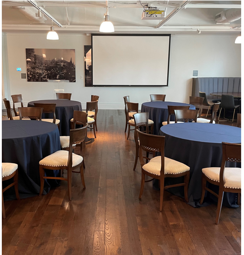
Opposite Page Top: Unknown