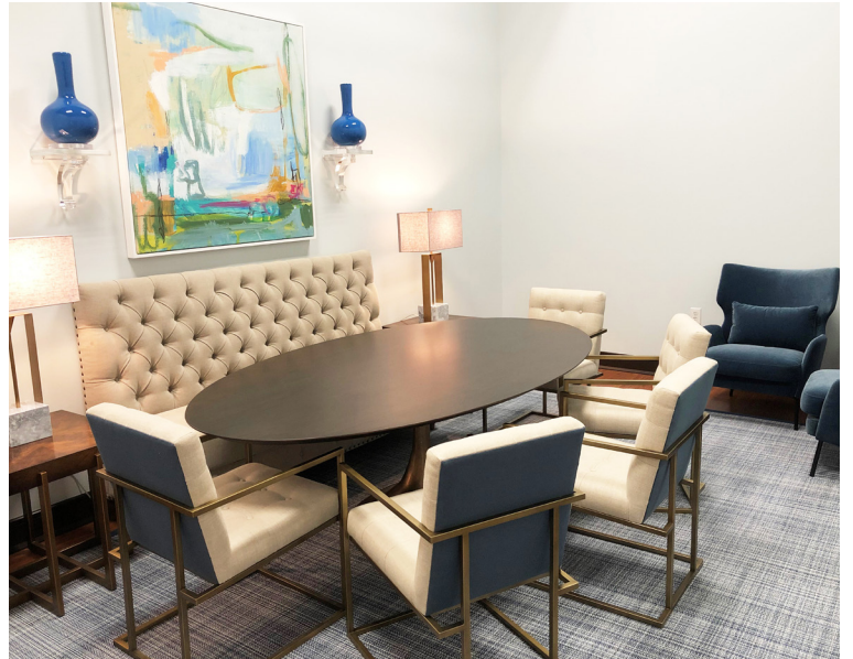
Opposite Page Steven Dickson