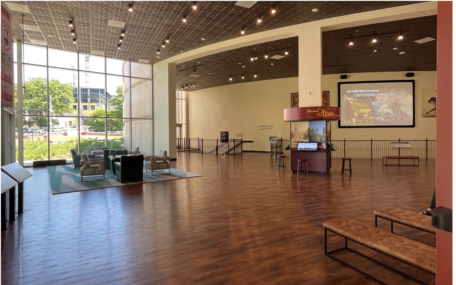
Opposite Page Top: Unknown