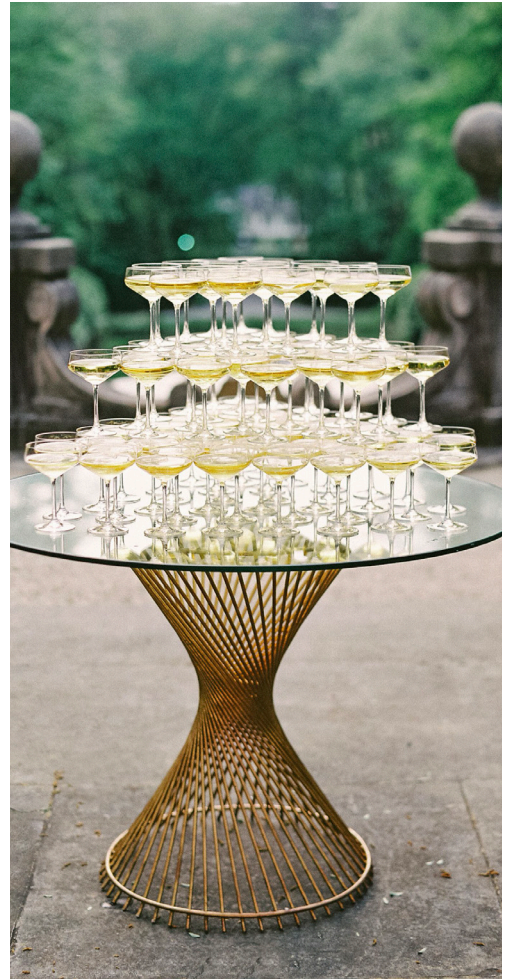
Opposite Page Unknown