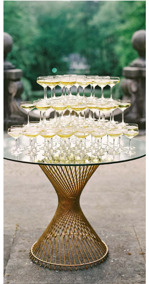
Opposite Page Unknown