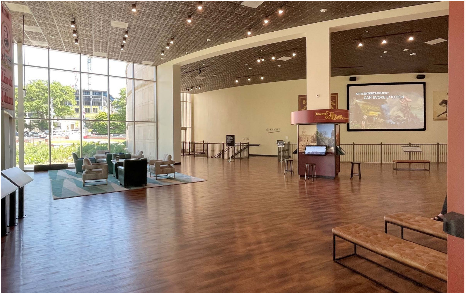
Opposite Page Top: Unknown