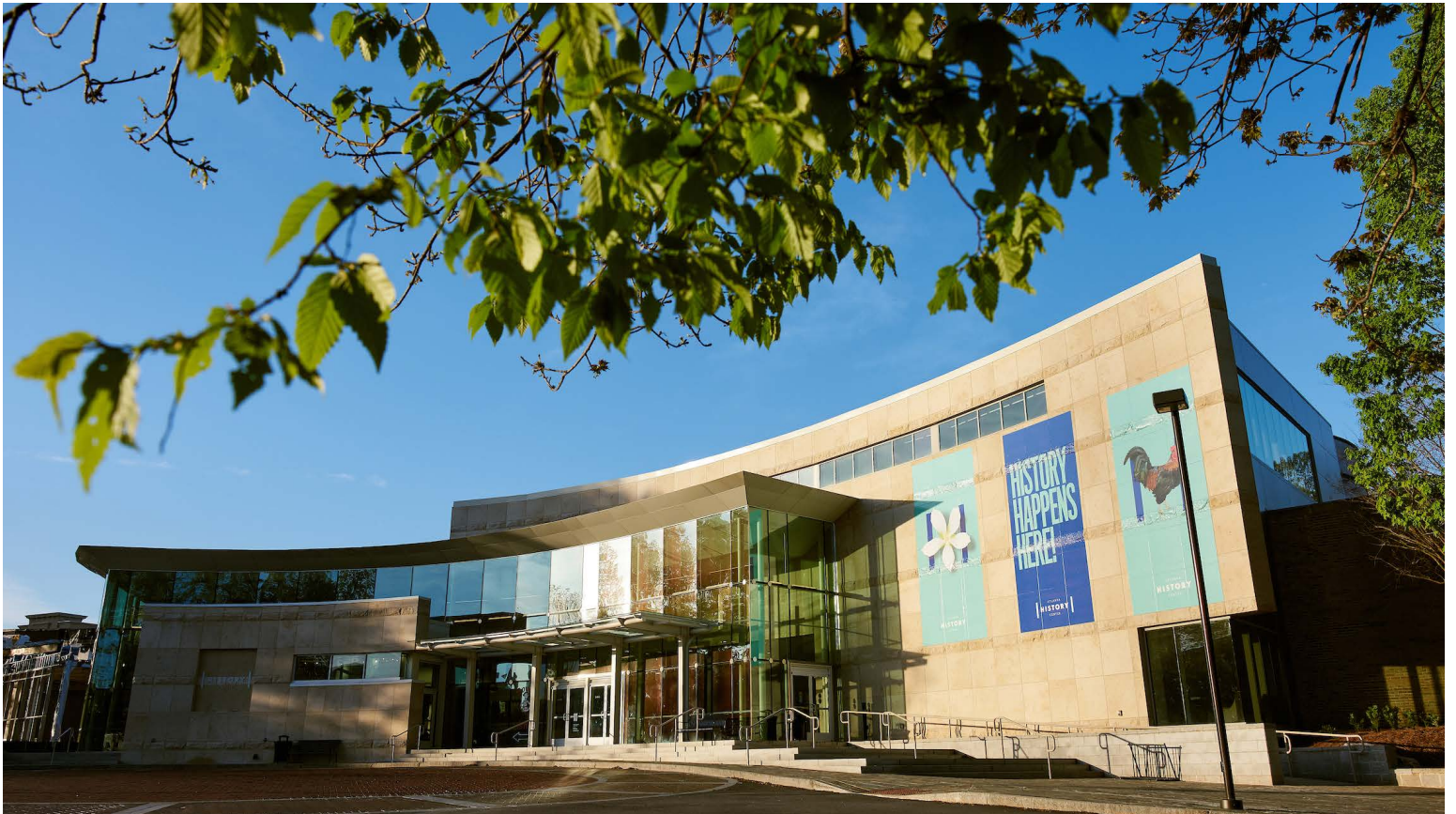
Opposite Page Top: Archetype Studio Inc. Bottom: Unknown Cover: Anne Rhett Photography