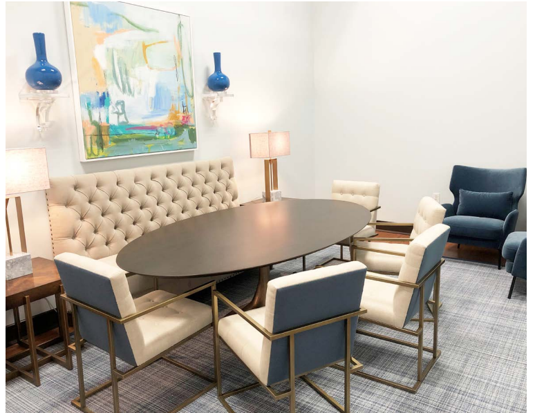
Opposite Page Steven Dickson