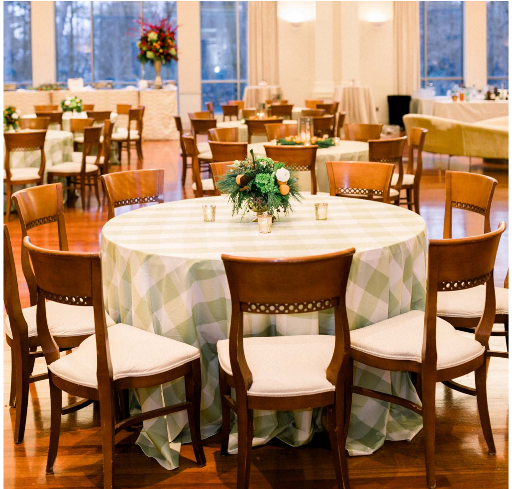
Opposite Page Top: Unknown