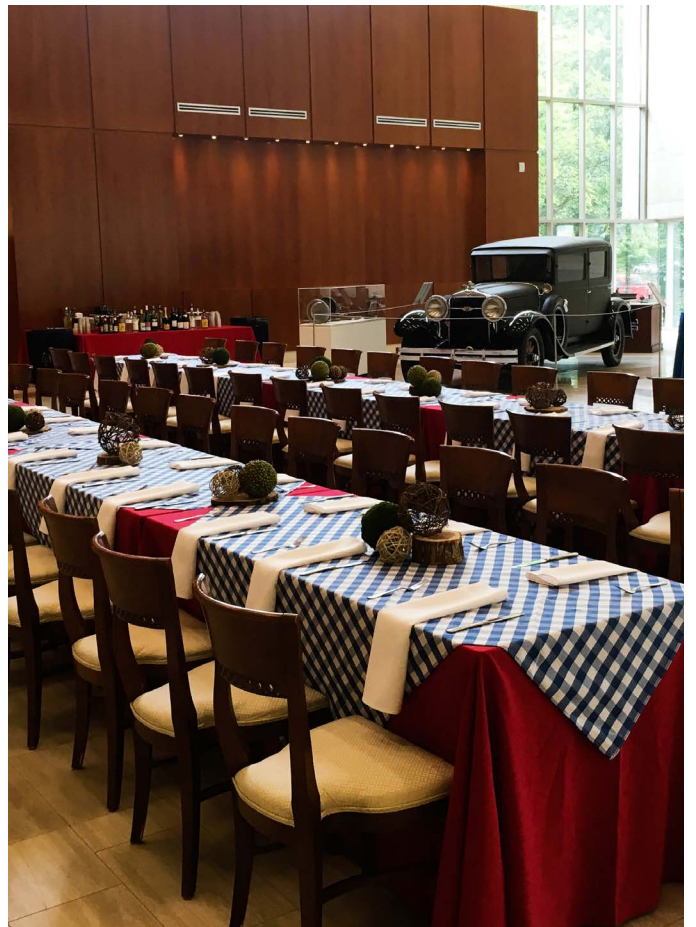
Opposite Page Top: Hales Photography