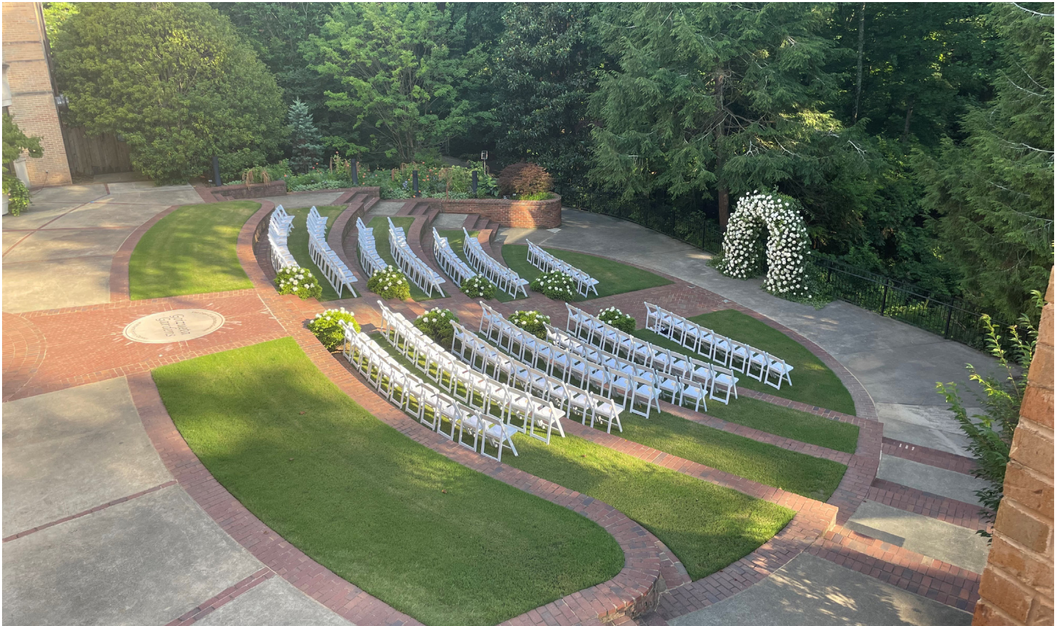
Opposite Page Ashley Cathy Photo