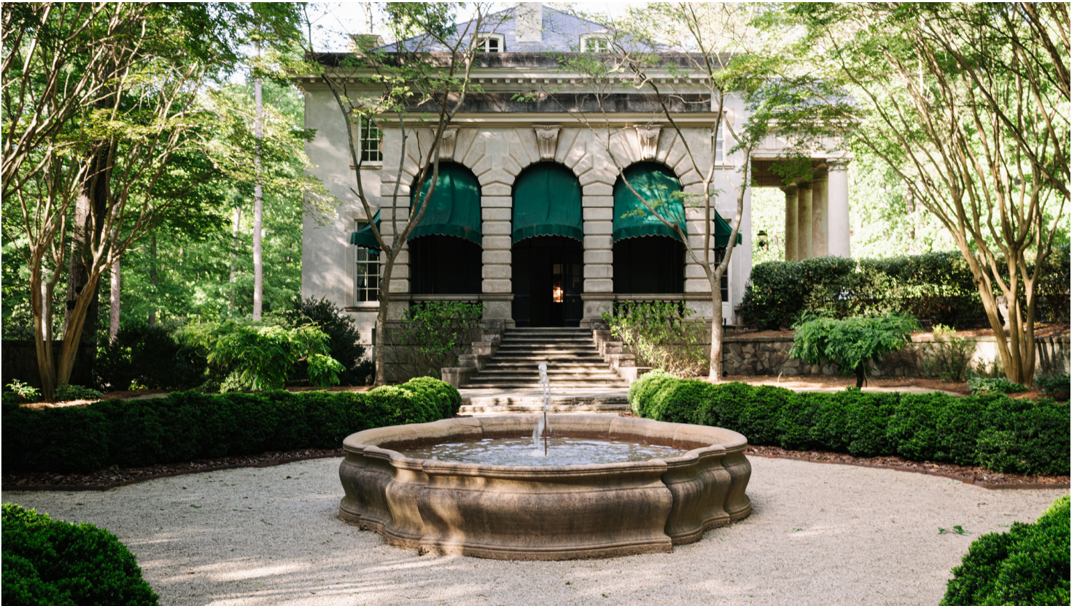
This Page