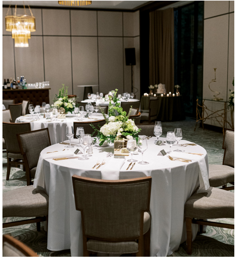
Opposite Page Sommer Daniel Photography