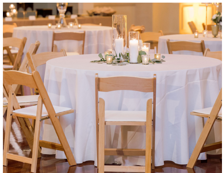
Opposite Page Picture This! Photography