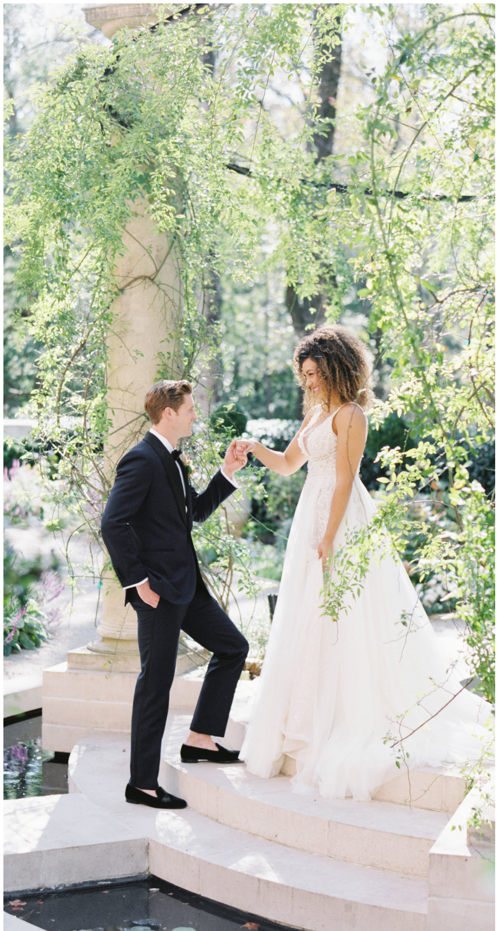
Opposite Page Top: Archetype Studio Inc. Cover: Megan Wallach