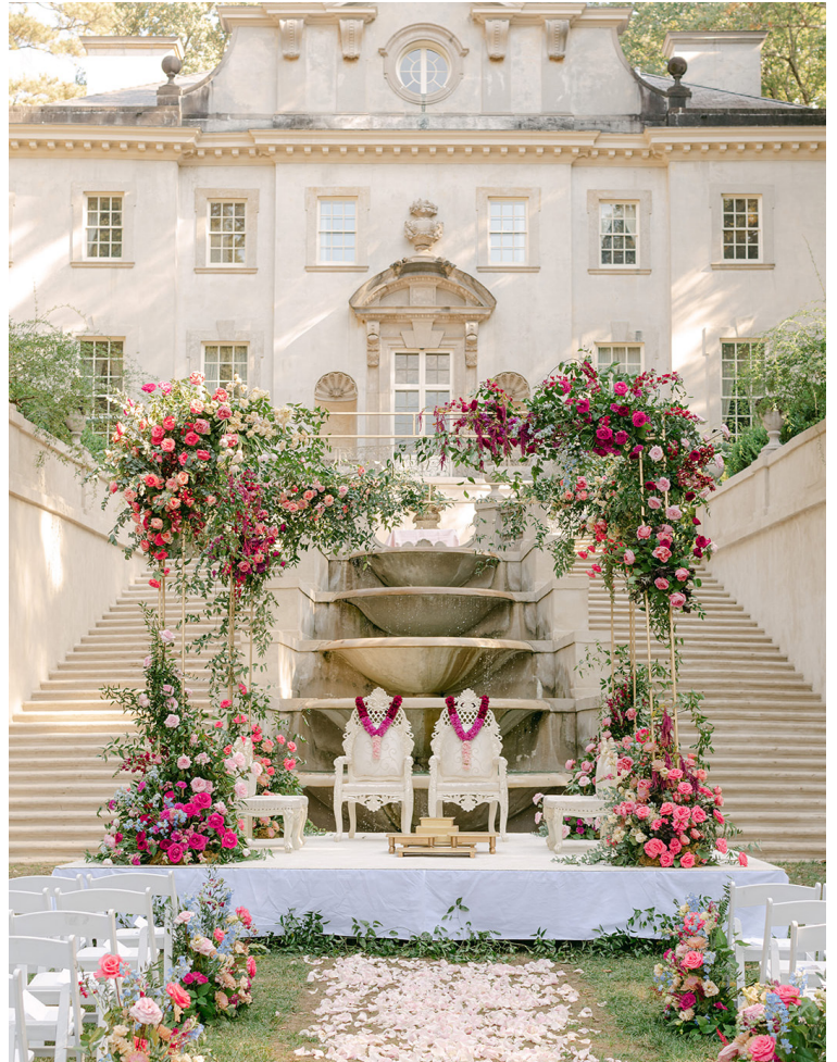
Opposite Page Eve Yarbrough